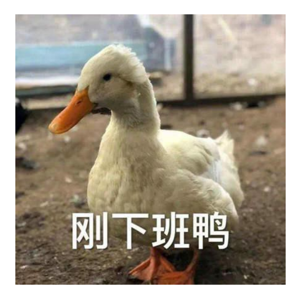
File photo: Just off duty

Such memes include "I don't want to work today", "go for it" and "need to cheer up today". Normal ducks, or duck-shaped cartoon characters and statues, are widely used. After coming out around mid-2018, they have dwarfed other animal emojis and have become the favorite of many young Chinese people on social media. Here is a widely used duck-themed meme, from which you can learn about humorous homophones in the Chinese language: